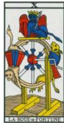
(Picture Right - The Sphinx and the Hidden Portal)

When the individual realises that he is the focal point of existence, and discovers the experienceable universe is nothing more than the personified energy of his own potential, the riddle of life is solved. Universally-determined cycles are understood and mastered. The sphinx, the barrier to the self-determined cycles of expansion, is overcome, and the individual progresses in his evolution (the expansion of existence by experience). This process and portal is described in the symbolism of the Key of Atlantis over which the Sphinx presides. This concept is confirmed in the symbolism of the 10th Tarot Card ('La Roué de Fortune' - The Wheel of Fortune) where the sphinx takes its true position as the authority that presides over the key of Atlantis and the Hidden Portal.