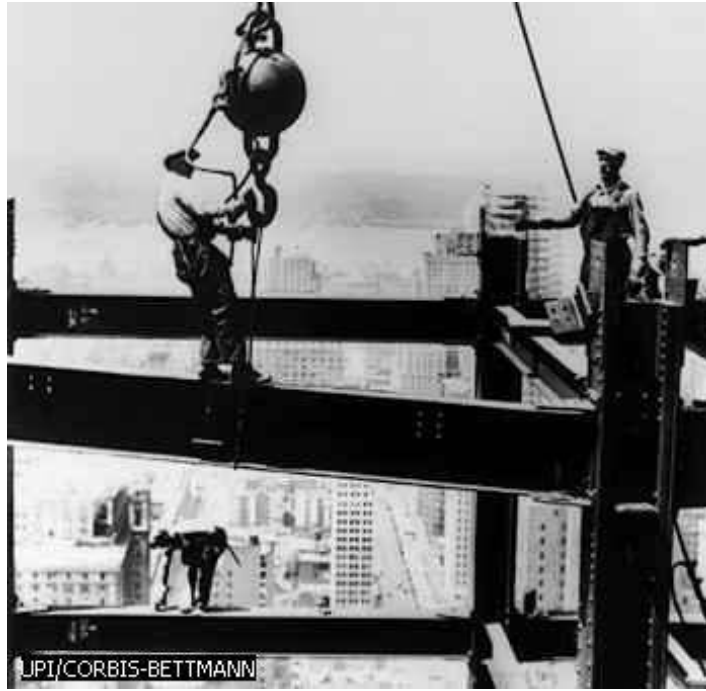
1930 - Empire State Building, New York