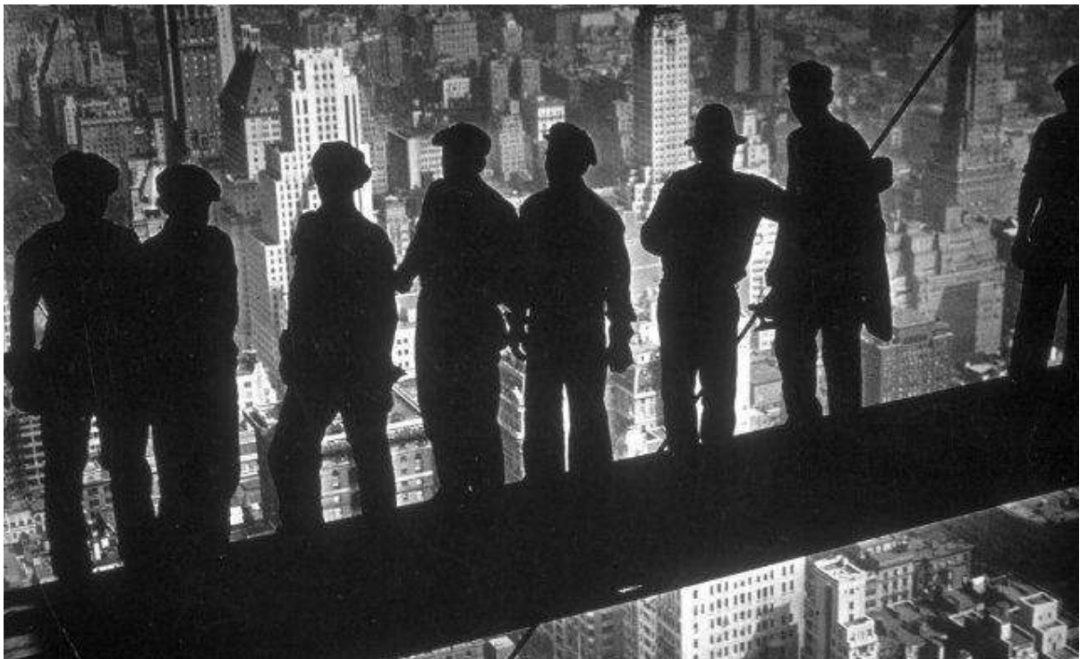
1932 - 70 Stories up on the Rockefeller Centre