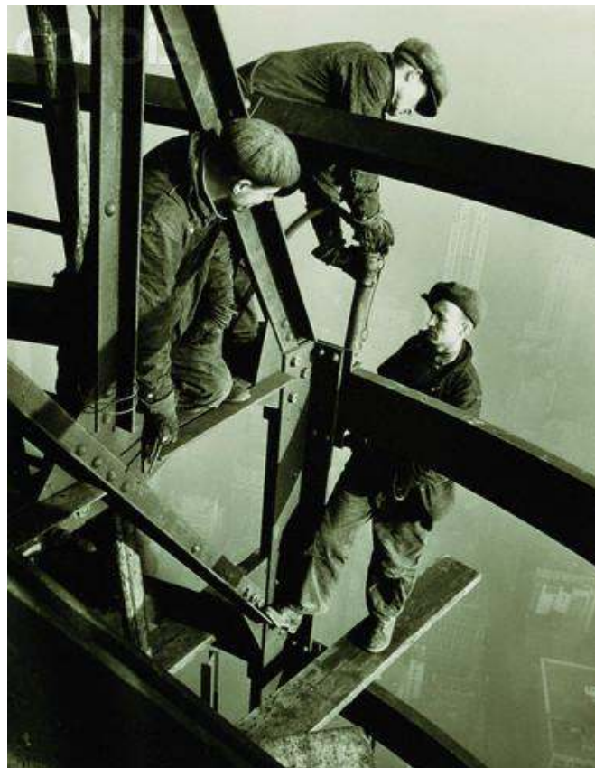
1930 - Top of the Mooring Mast, Empire State Building, New York - Image by Lewis Wickes Hine