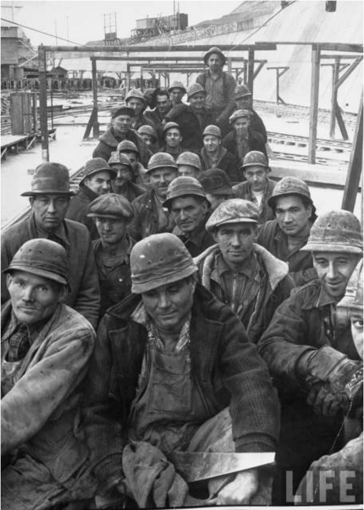
1936 - Pittsburgh Steel Workers