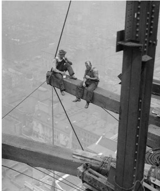
02 August 1926 - Paramount Building on Broadway in Times Square, New York