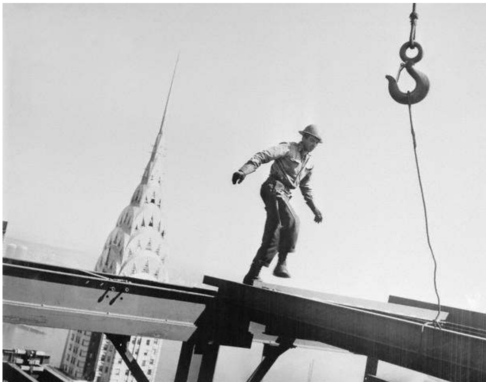
25 August 1962 - Pan Am construction site, New York