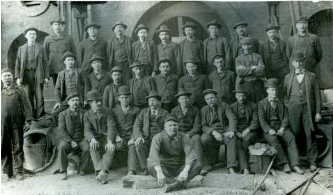
1894 - Chicago Steel Workers