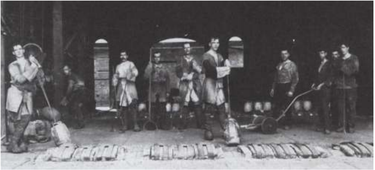
Undated - Unknown mill location