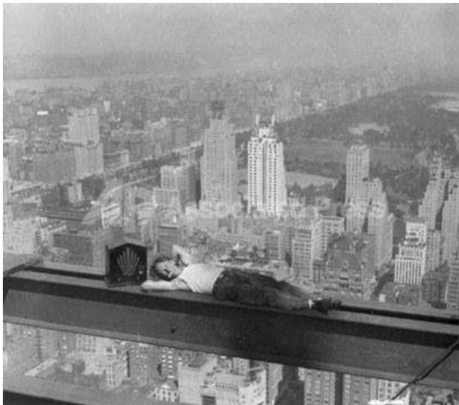
Above 4 x Photos

Sept 1932 - Construction workers, RCA Building at Rockefeller Centre, New York