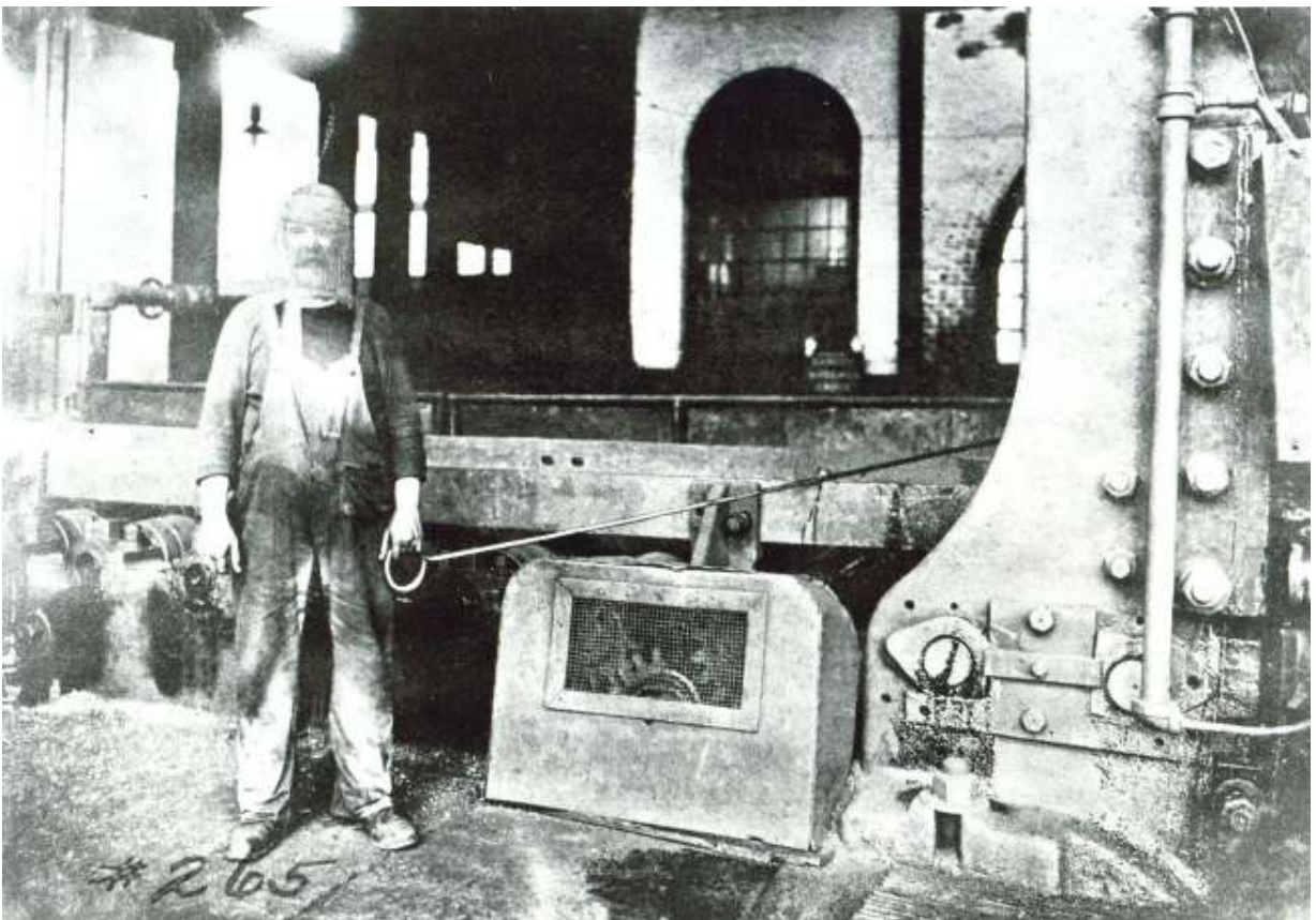
c.1890 - Worker at Illinois Steel, wearing an early net protective safety mask