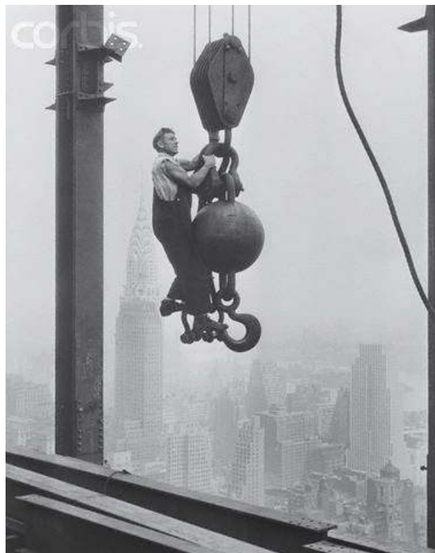
29 September 1930 - New York, Empire State Building