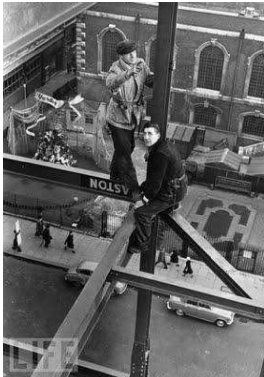
1925 - Construction of an Early Skyscraper - Unknown Location