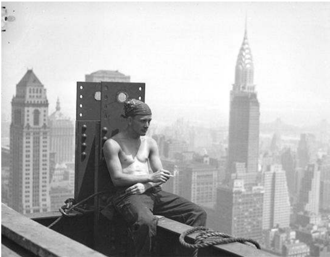
1931 - Empire State Building