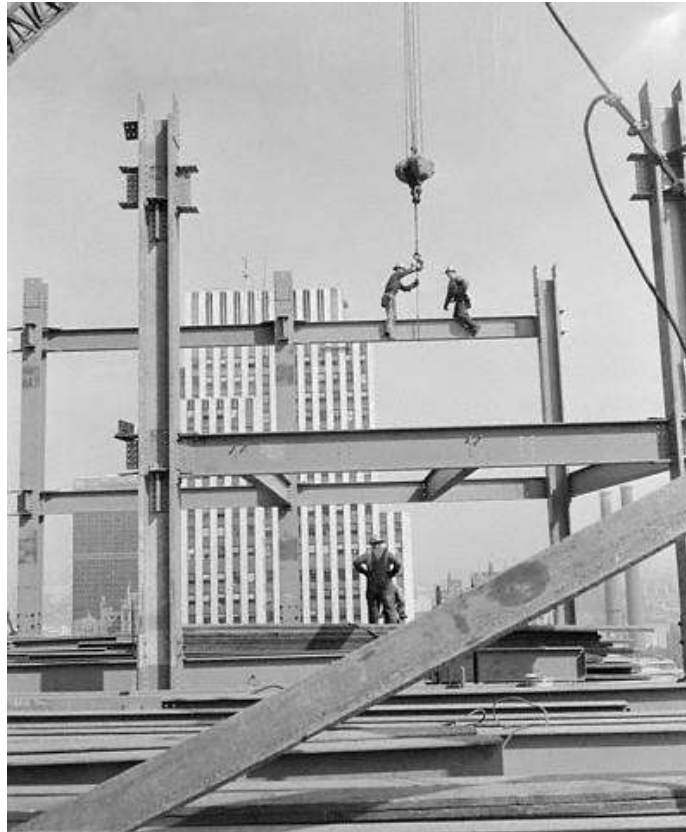
04 May 1955 - Grand Central Station Manhattan, New York