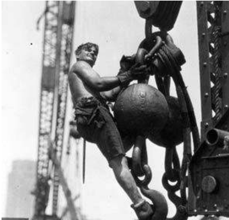
1931 - Empire State Building - Image by Lewis W Hine