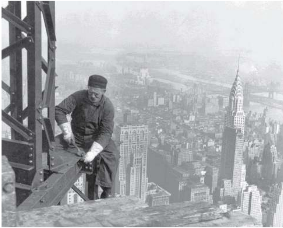
1930 - Older Construction Worker - Empire State Building, New York