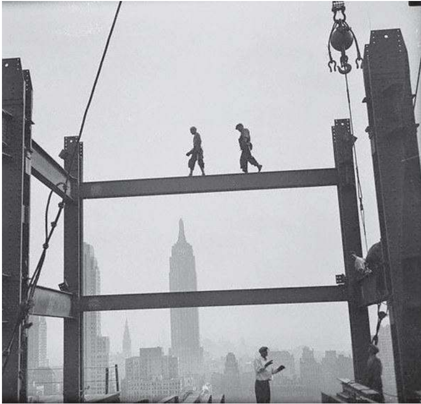
1932 - Rockefeller Centre - Image possibly by Charles C Ebbets