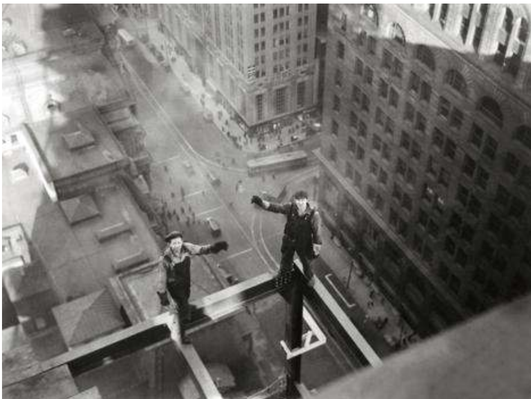
1926 - Lincoln Liberty Building, Philadelphia - Image by E O Hoppé