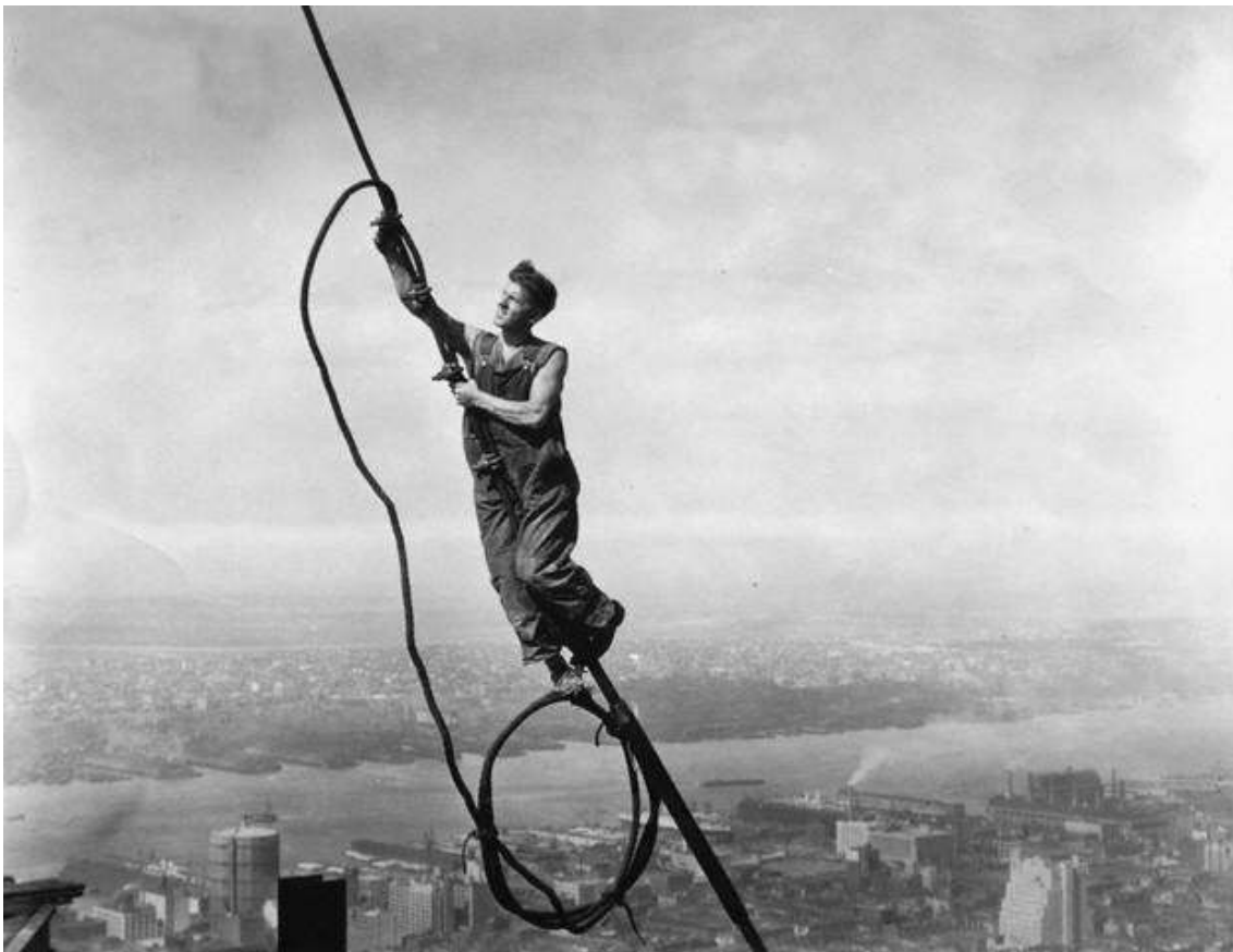
1931 - Empire State Building - A worker fastens a steel cable to hold a derrick in place