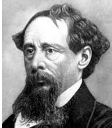
Charles Dickens (07 Feb 1812 - 09 Jun 1870)